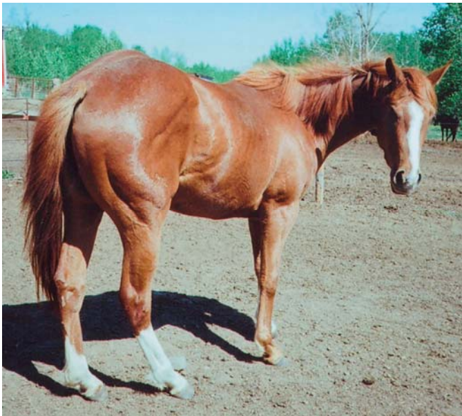
2006 AQHA SORREL MARE