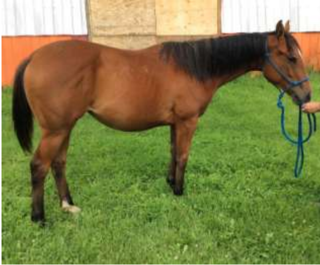
ZILLAS FOX 2015 BAY FILLY AQHA #X0722682