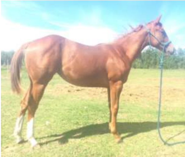
SHESA RED WOLF 2015 SORREL FILLY AQHA # PENDING