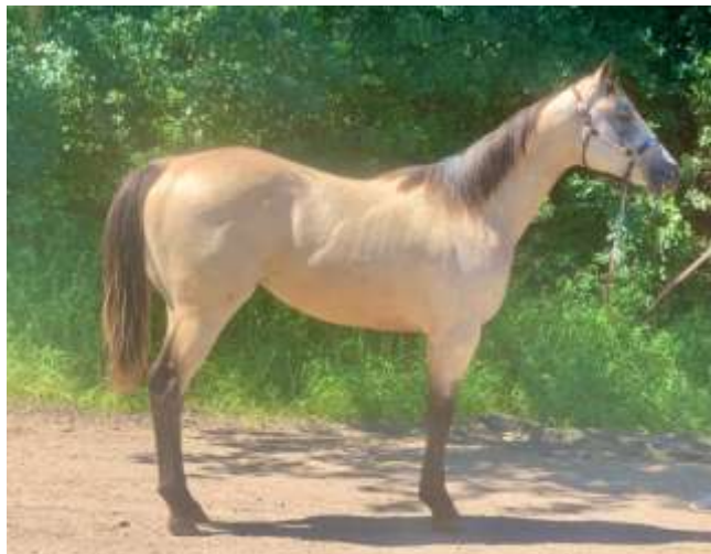
MISS YOU MUCH 2020 BUCKSKIN MARE AQHA # 6077382

This Filly has all kinds of eye appeal and is guaranteed to ride and give it her all! Her Dam was very trainable and easy when rode. Her sire was a gritty multiple 1D winner and has produced many winners in every level from Futurities, Derbies and rodeos. Once you've owned a Blue Em Away you'll wonder why you didn't get one sooner.