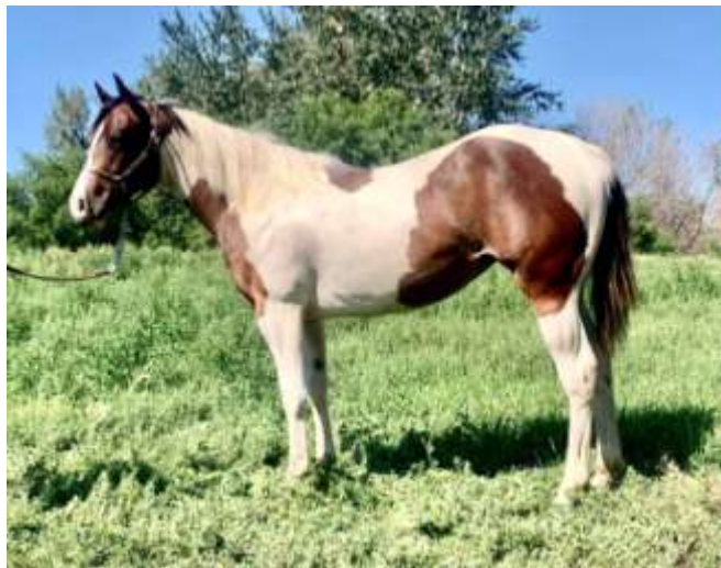
CORONA DELIGHT 2020 BAY/TOB MARE APHA #1106026