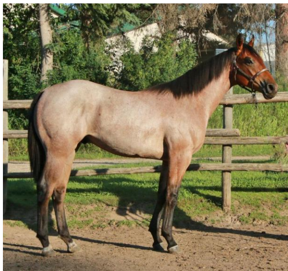
OBSESSED FRENCH GUY 2021 BAY ROAN GELDING AQHA #6025548