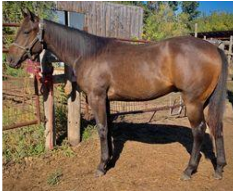
ICED FRAPPUCCINO 2021 BROWN GELDING AQHA#6126322