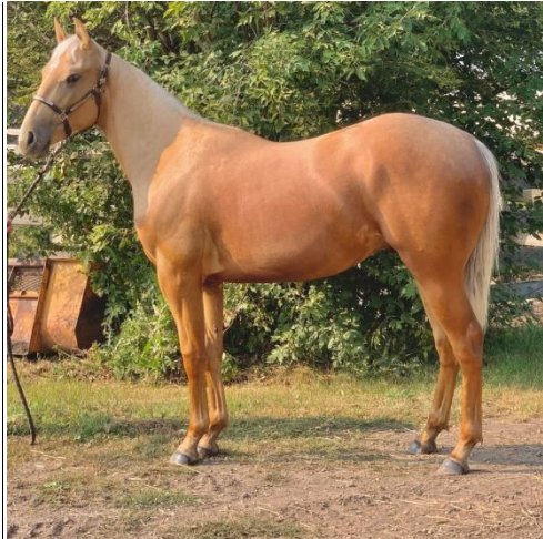
A DASH OF VANILA 2021 PALOMINO GELDING AQHA#6126324