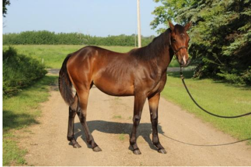
BLUE BOYS LADY 2021 BAY MARE AQHA# 6092416