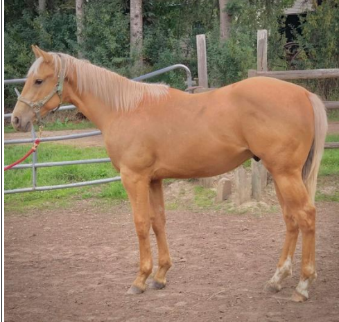
VANILAS FAME 2022 PALOMINO GELDING AQHA#6199807

This gelding is a splitting image of Latte. Latte's are proving themselves in the barrel pens in the US. (off spring are not of age in Canada) The dam has produced many barrel horses.